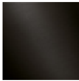
Dark Platinum matte 20 006 706-99

More custom finish options are available via special production (xTra Service). Please see our finish matrix for availability and pricing or contact a Dornbracht representative.