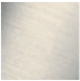
platinum matte 20 006 706-06